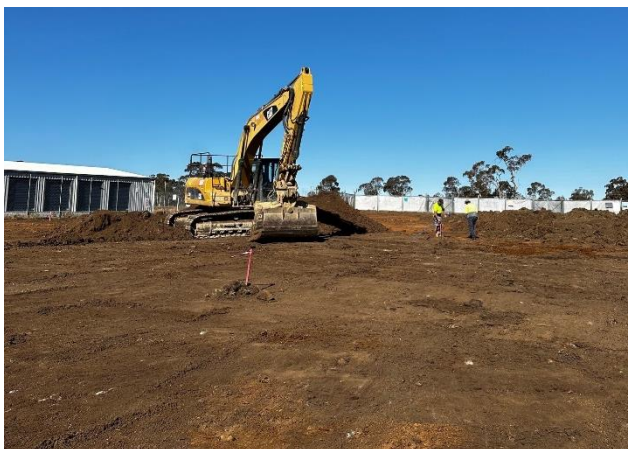
Site has been cleared of grass, levelled (cut and fill) and the set-out has been completed.

Construction staff are on site daily, together with Rice Project Management staff on most days. The Construction Program shown below, sets-out the planned (6 month) timetable, including occupation by year-end and project completion by February 2024 (subject to weather and other uncontrolled issues). As shown in the program, to date bulk earthworks, site levelling and building set-out have been completed to provide for the initial pouring of concrete slabs.