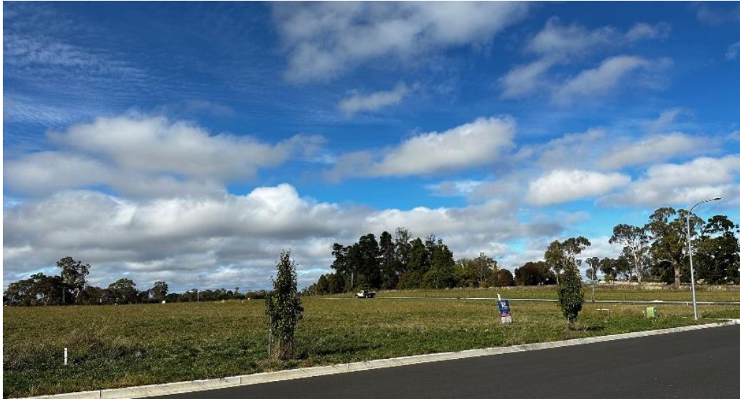
Waller Avenue site prior to commencement of construction

With the granting of a Construction Certificate and appointment of Armidale Regional Council as the PCA [Principal Certifying Authority], we have been able to commence construction; including the provision of services, the supply and connection of electricity, the erection of security/safety fencing and site buildings and storage.